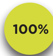
■ Tax-Exempt Dividends